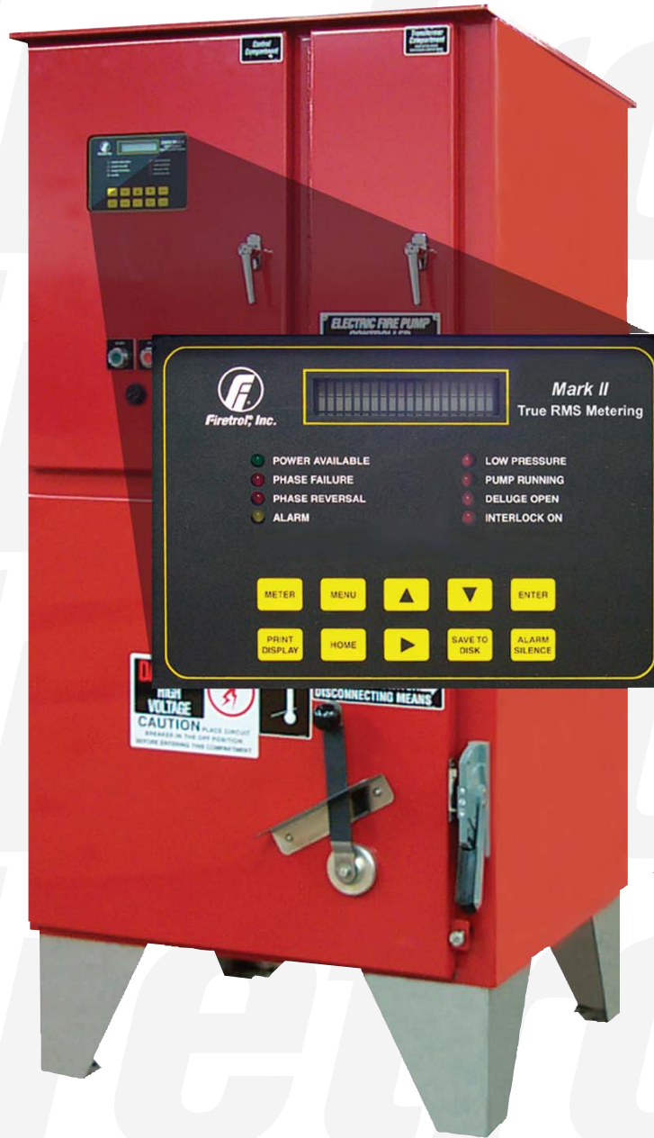
Mark II User Interface